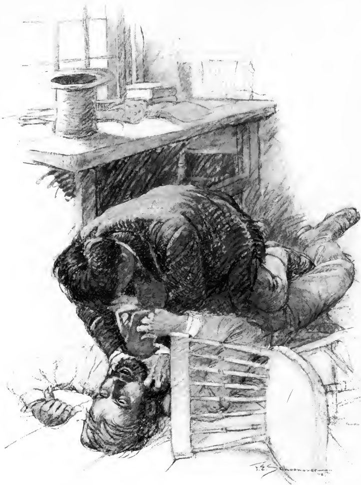
His fingers twined about the purplish throat.—Page 211